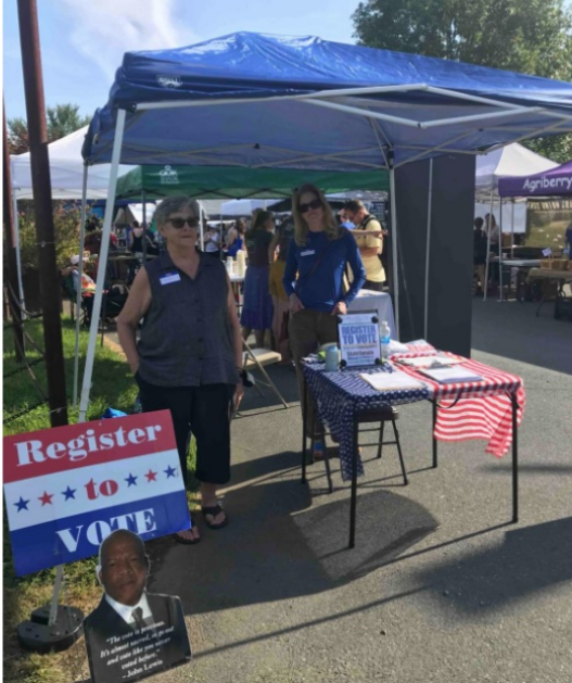
Photo: Registering new voters at Ix Market. The foreground quote from 17-term Rep. John Lewis (D-MD) says, "The vote is precious. It's almost sacred, so go out and vote like you never voted before."

Weekend rain has slowed us down a bit, but we continue to get out into the community to register new voters. We've tabled at Mel's Diner, Sunshine Market on Cherry Ave., Community Day at Washington Park, UVA's Community Fair for high-school seniors, Mudhouse on the Downtown Mall, Kardinal Hall,