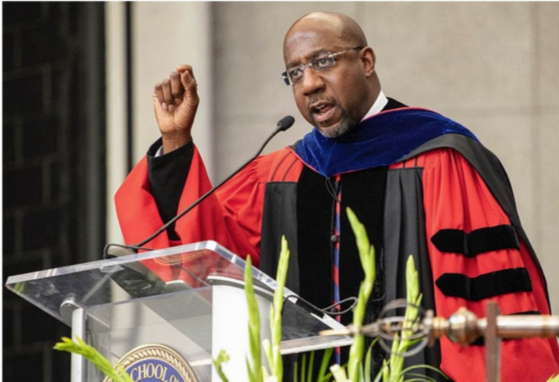
Senator Reverend Raphael Warnock

Join Democrats from across Virginia at this year's Blue Commonwealth Gala in Richmond, June 22 at 7pm. The Gala is the annual fundraiser of the Democratic Party of Virginia and is the premier gathering of elected officials, candidates, community activists, and Democratic Party leaders.