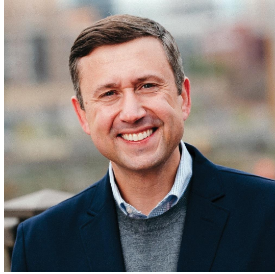
Incoming DNC Chair Ken Martin (from DNC website)