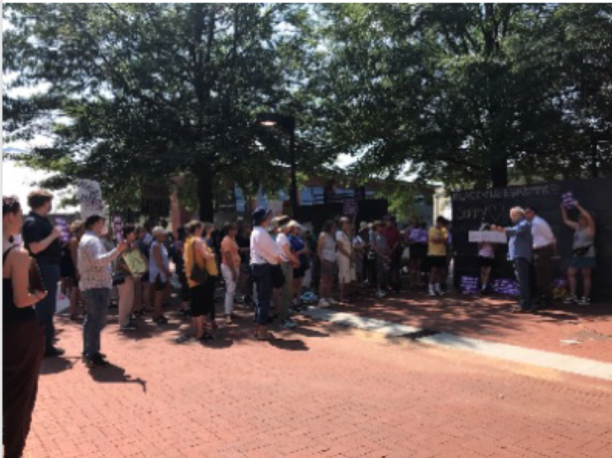
Raised/Razed Movie Discussion (July 28th)