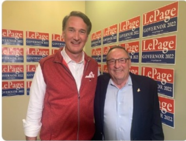
5:36 PM · Sep 7, 2022 · Twitter for iPhone

... Youngkin campaigning this evening in Maine for unhinged extremist and virulent racist former Gov. Paul LePage (R). Just a reminder that, among his many MANY insane and extremist comments, LePage has said: “the enemy right now is people of color”; the “NAACP should apologize to the white people”; “people of color are coming to Maine to impregnate white women”; etc. LePage is also a climate science